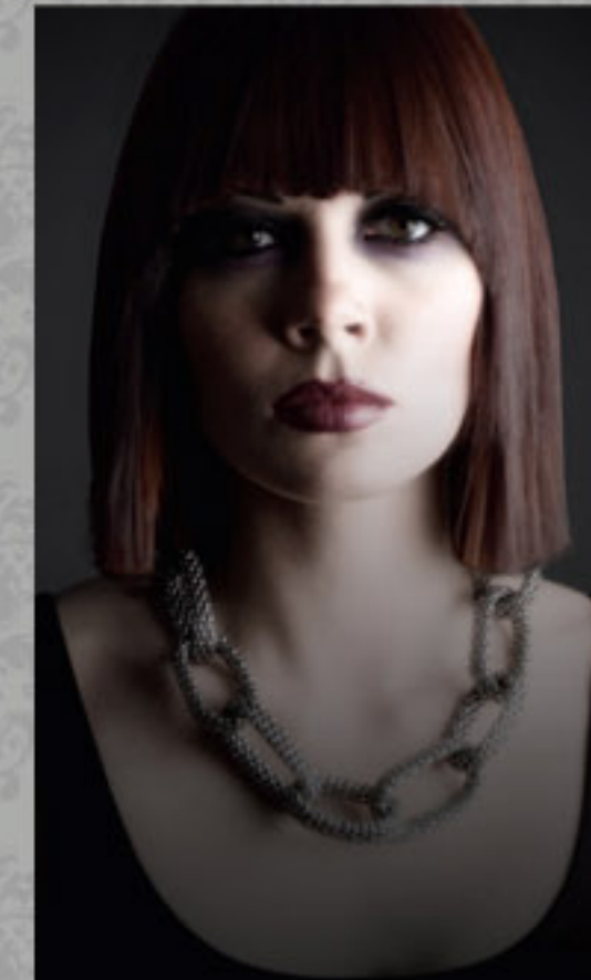
MPS | The Referral Card

CALL NOW to make your appointment! 214.219.3030